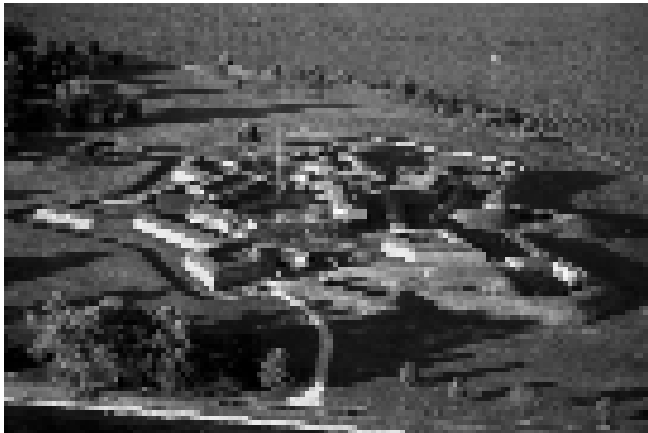
Baltimore's Fort McHenry