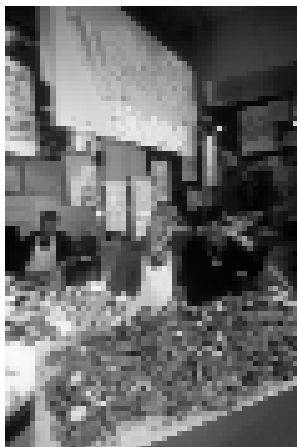
All the crabs you can eat!!