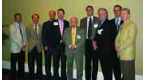
Members of the old and new Executive Committees